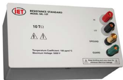
SRL-10T High-Accuracy Resistance Standard