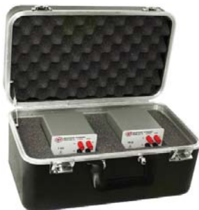
SRC-100 Transit Case for 2 units

changes during transportation or shipping. It is suitable for transporting and storing two or more units.