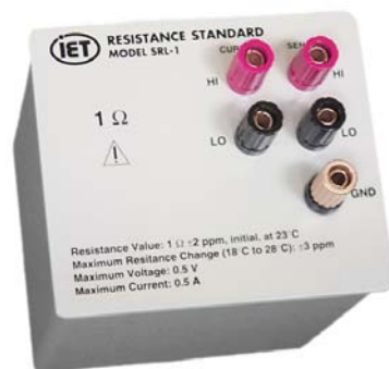
SRL-1 High-Accuracy Resistance Standard