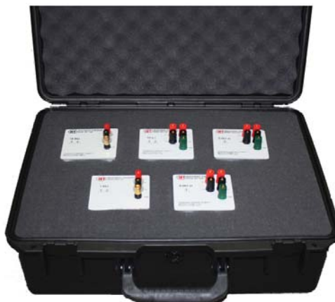
SRC-10-n Transit Case for n units (5 units shown)