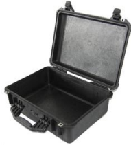
Cable plastic case