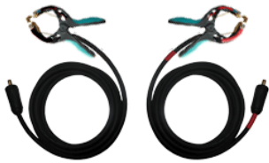
Current cables with TTA clamps