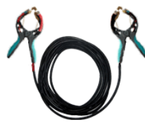
Current connection cable