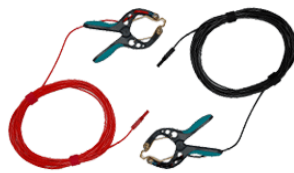
Voltage sense cables with TTA clamps