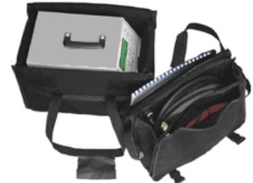
Cable bag and device bag

*The above cables are also available in several lengths. Please contact DV Power for more information.