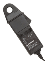
Current clamp 30 / 300 A + cable set 5 m