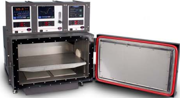
avionics systems production