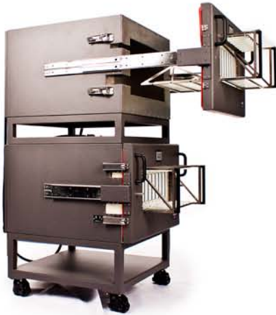
PCB batch production