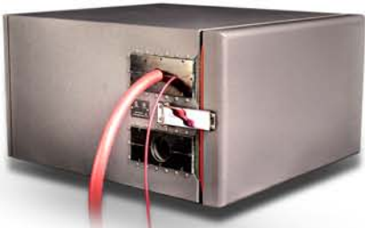
guidance telemetry systems

Sigma Thermal Chambers for a variety of industries and applications