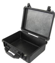
Cable plastic case