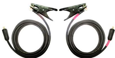
Current cables with battery clamps