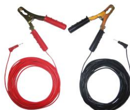
Sense cables with alligator clamps