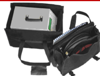
Cable bag and device bag

*The above cables are also available in several lengths and terminations. Please contact DV Power for more information.